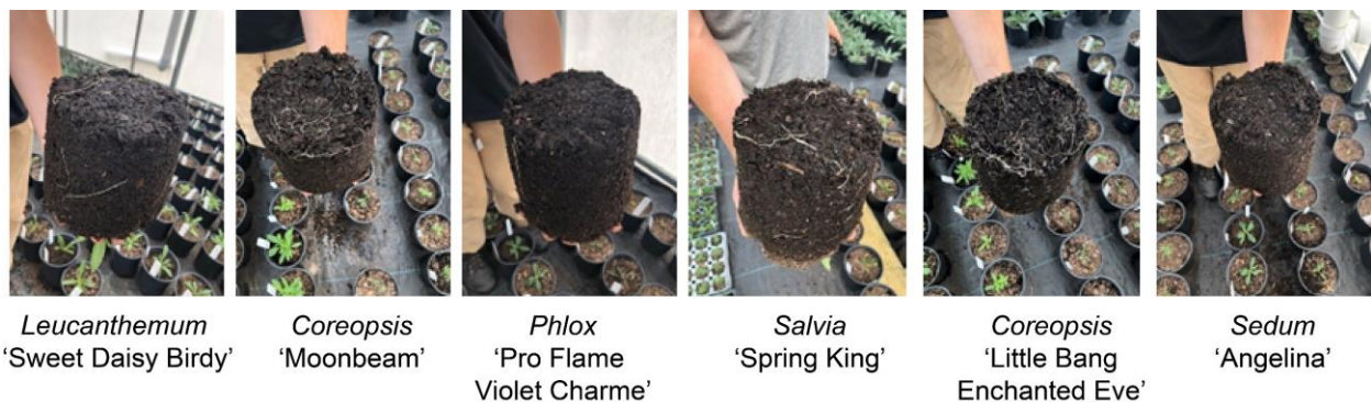
Figure 1. Root development to the base of the container after 19 days.

By the end of the 3 rd week, most taxa had shown vigorous root development to the base of the container (Fig. 1).