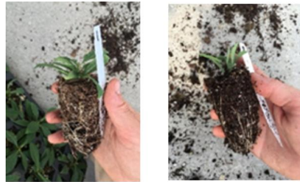
Phlox ‘Pro Flame Violet Charme’

The 32-cell trays in Flat and Pack mix were transplanted the beginning of week eight into trade one-gallon containers with nursery mix. The same limitation applies to Flat and Pack mix as nursery mix. The trial finished September 28 th after plants had grown for 4 weeks and reached similar height and width to Basewell™ stuck initially in trade 1-gal containers.