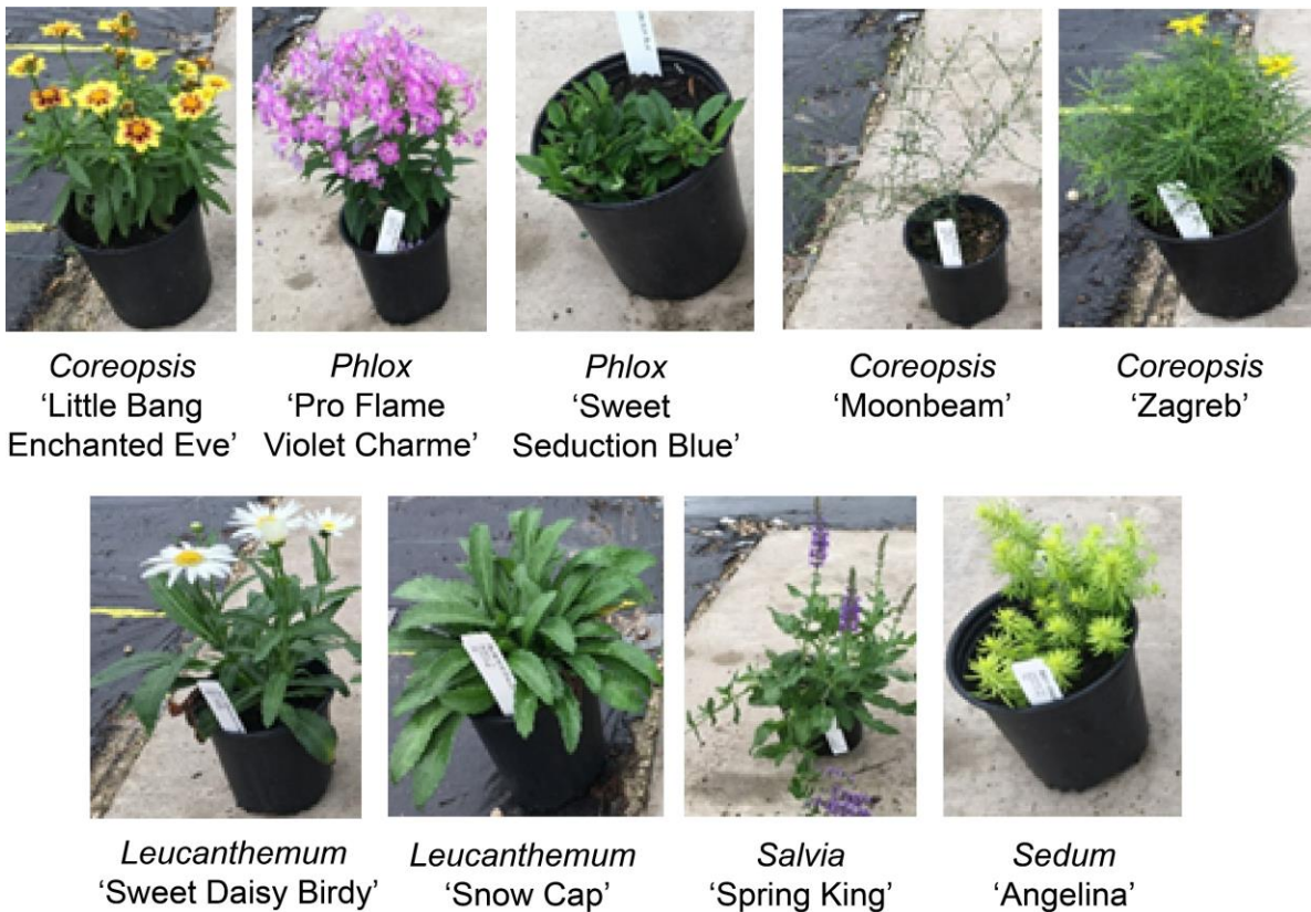
Figure 2. Growth of trade 1-gal containers with nursery mix after 10 weeks for nine taxa

to be 10 weeks for each taxon (Fig. 2). The conclusion was made after the populations of Leucanthemum ‘Sweet Daisy Birdy’, Salvia ‘Spring King’, Coreopsis ‘Little Bang Enchanted Eve’, Coreopsis ‘Moonbeam’, Coreopsis ‘Zagreb’, and Phlox ‘Pro Flame Violet Charme’ were observed in full bloom, and taxa had grown throughout their entire containers. Taxa that were not in full bloom after 10 weeks were Leucanthemum ‘Snow Cap’, Phlox ‘Sweet Seduction Blue’, and Sedum ‘Angelina’. These taxa had strong vegetative growth throughout 10 weeks, but did not send out flower buds. It is likely that time of planting, lighting, and short period of growth may have limited flower production for those taxa.