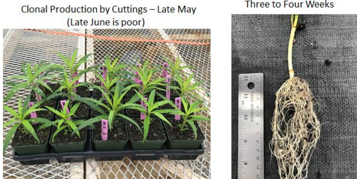
Figure 8. Clonal propagation by cuttings of Helianthus verticillatus .

All of these are clonal, which is essential for determining compatibility and controlled (not open pollination) breeding for desirable traits.