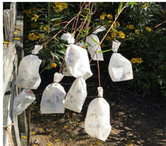
Figure 4. Pollination bags covering multiple heads of Helianthus verticillatus . Seeds were harvested in November 2017.