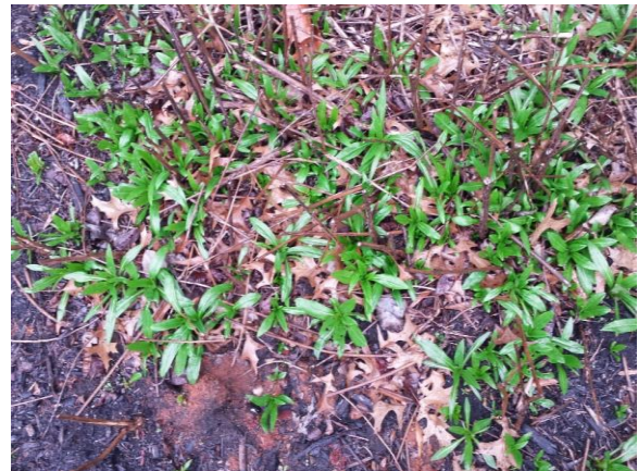
Figure 1. Helianthus verticillatus emerging in the spring.

Plants emerge in late winter in Tennessee as a basal rosette (Figure 1) and reach 3-4 meters by August (Figure 2). It flowers profusely in August and September, and through the middle of October or until a killing frost. The plants bear up to 20, 4-6 cm diameter yellow ray flowers with brown to black discs at the 20-30 cm of the termini of