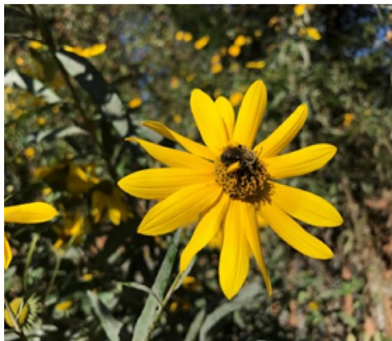
Figure 3. In the center of the flower is a native bee ( Bombus sp.), a potential pollinator of Helianthus verticillatus .