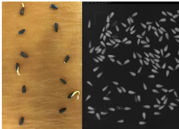
Figure 5. Seed germination (left) and X-ray analysis for viability (right) in Helianthus verticillatus .

Seeds were collected from a 200-stem stand growing in Maryville, Tennessee in November 2017. Seeds were separated from somatic tissues, stored in glass vials at room temperature, and shipped via postal service to the University of Florida in early February 2018. Pre-germination and seed viability were assessed with 100 seeds using a tetrazolium staining method (Peters, 2005) over 18-24 hours. Seeds with embryos that evenly stained dark pink- to -red were considered viable (Figure 5).