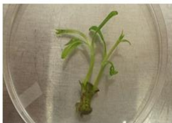
Figure 7. Clonal propagation by tissue culture using explants from axillary buds and leaves of Helianthus verticillatus .