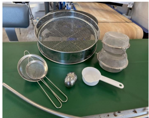
Figure 7. In-house seed cleaning tool use training secession.