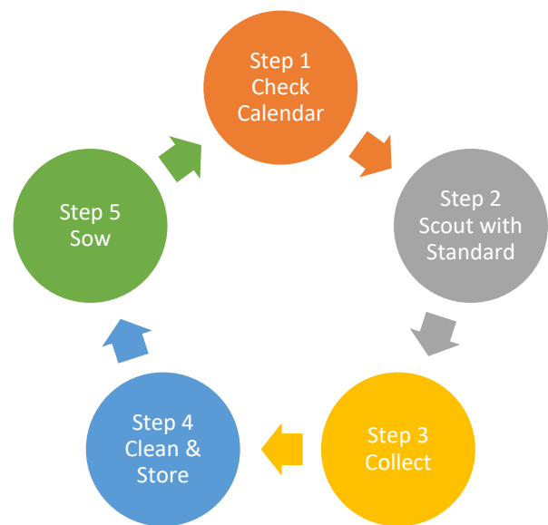
Figure 4. Steps in quality seed production.

A sophisticated system of maps is employed for positive identification on our growing plots, Full color pictures of the specific plant including what the seed looks like ( Fig. 5 ). It cannot be stressed enough that proper labelling insures accountability.