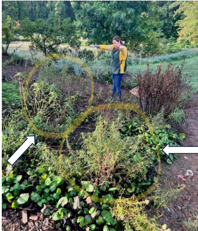
Figure 6. A target plant in the growing area circle in yellow for positive identification.