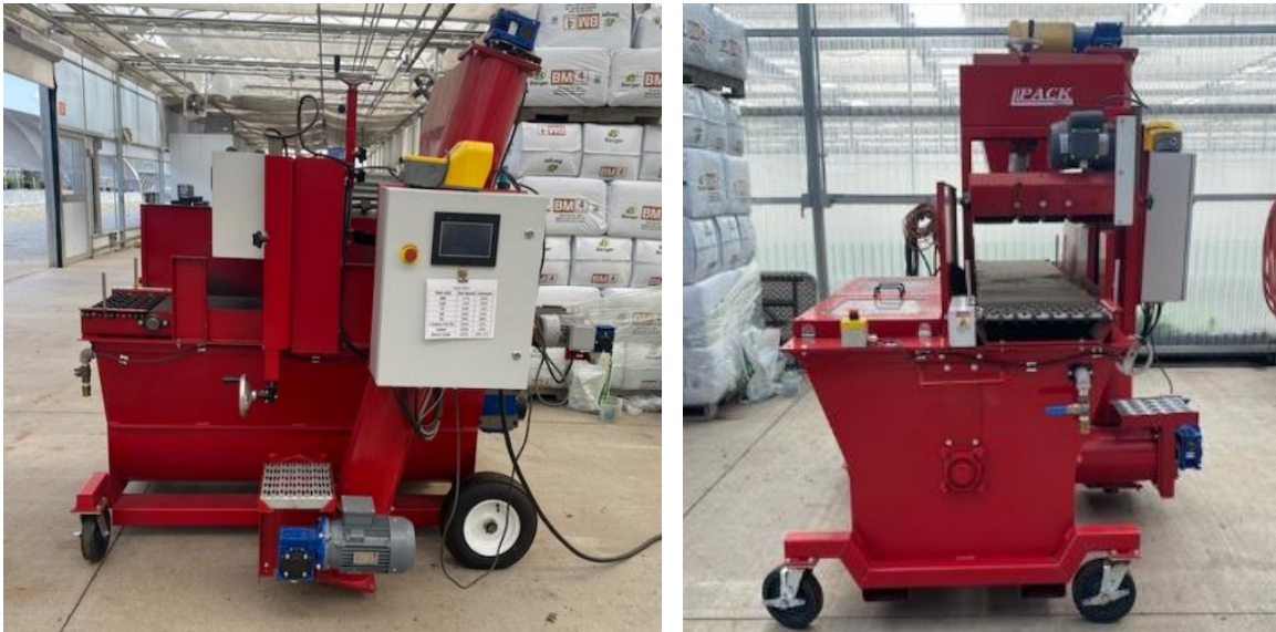
Figure 9. High volume flat filler and seed sowing machine.

for soil incorporation with slow release fertilizer, biologicals, etc. It can be used to can fill ~180 72s/50s cell flats per hour or ~200-gallon pots per hour. We still fill flats the old way by hand for sowing some seeds.