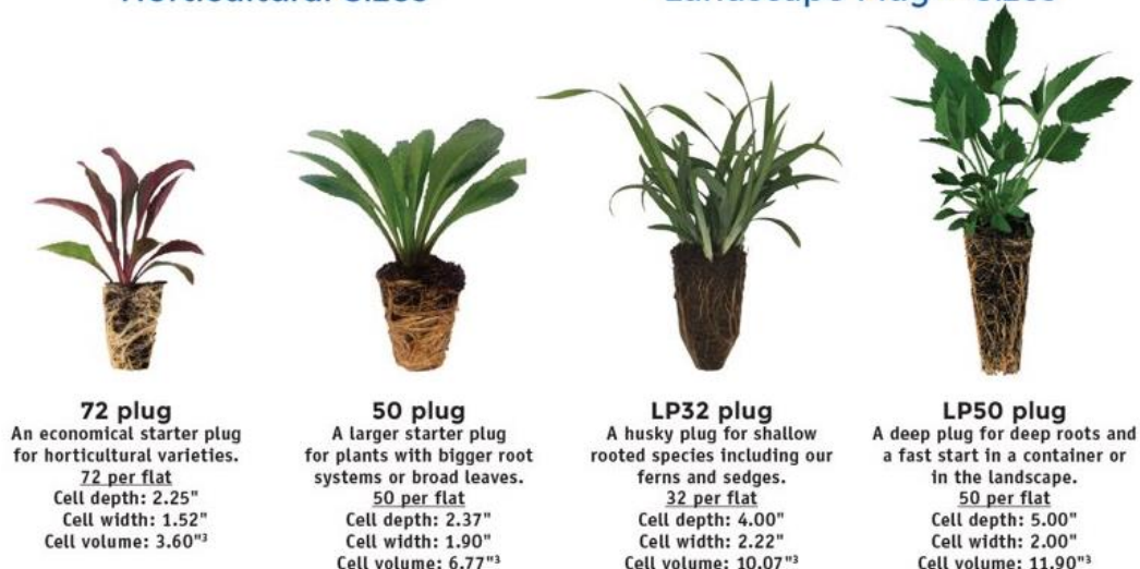
Figure 2. Plug sizes produced at North Creek Nurseries.