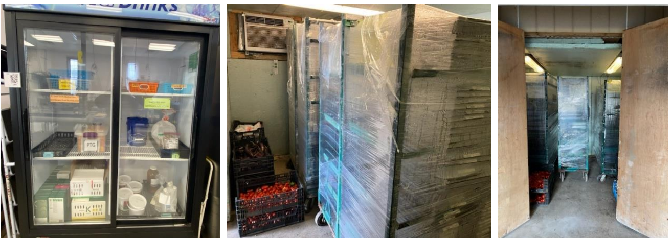
Figure 10. Cold storage units vary from walk-in storage to something as common as a kitchen refrigerator.

storage has many applications including seed prep, cold moist stratification, beneficial insect storage and in a separate specialty chemical storage area.