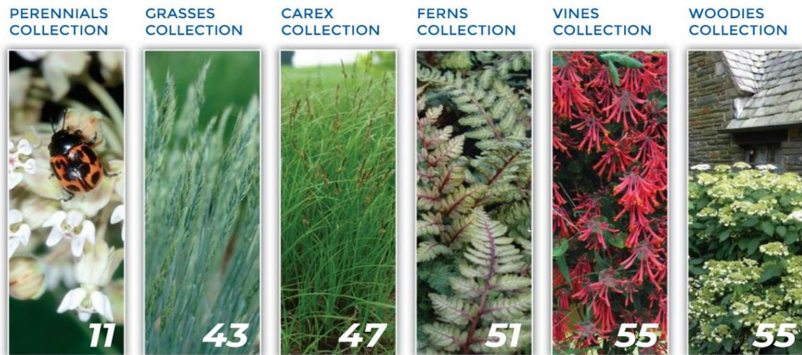
Figure 1. shows the product mix by plant collection and items offered in multiple sizes. All plants are grown as plugs in standard plug trays configurations.

houses as well. North Creek offers plugs of perennials, grasses, Carex , ferns, woody vines, and a few woody shrubs ( Fig. 1 ).