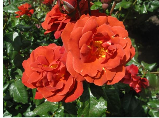
Figure 7. Rosa 'Hot Chocolate' (Simchoco).