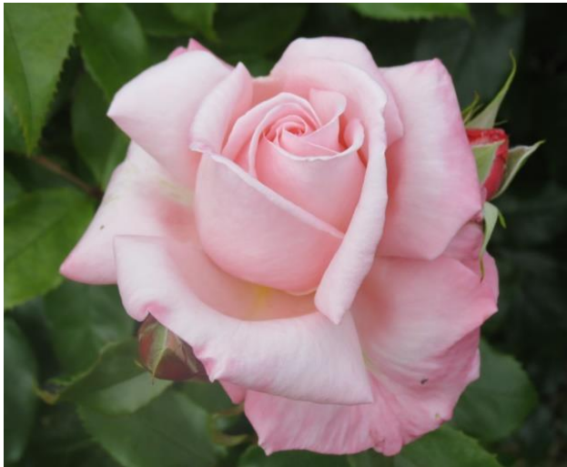
Figure 4. Rosa 'Aotearoa' (Macgenev).

He also bred the traditional Hybrid Tea's, Floribunda's and Climber's which sold well including 'Aotearoa' (Macgenev), 'Paddy Stephens' (Macclack), 'Solitaire' (Macyefre), 'Sexy Raxy' (Macrexy), 'Trumpeter' (Mactru), 'Bantry Bay', 'Dublin Bay' (Macdub) and 'Schoolgirl'. A range of compact free flowering miniature roses were often given New Zealand place names such as 'Kaikoura' (Macwalla), 'Wanaka' (Macinca) and 'Kapiti' (Macglemil).