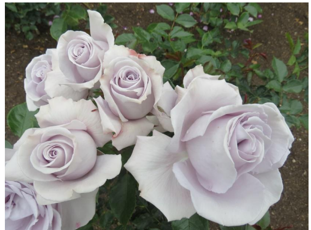
Figure 14. Rosa "Hi Ho Silver" (Athysumo).