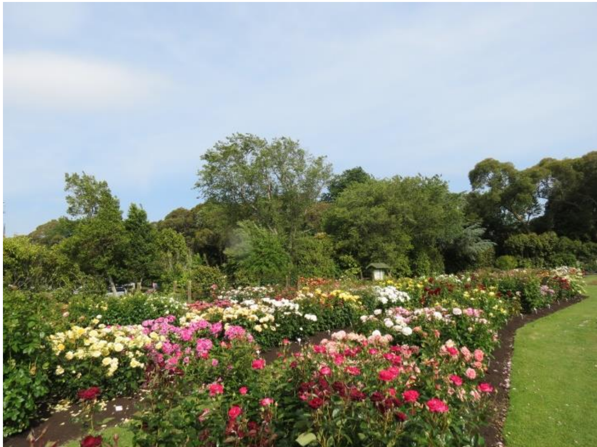
Figure 1. The New Zealand Rose Society Trials, Palmerston North.

various reasons, none of these survived more than a few years. In 1969, the New Zealand Rose Society established International Rose Trials in the newly developed Dugald Mackenzie Rose Garden in Palmerston North with strong support given from the Palmerston North City Council. This was the first international rose trials established in the southern hemisphere and tests un-released roses from New Zealand and international breeders over a two-year period.