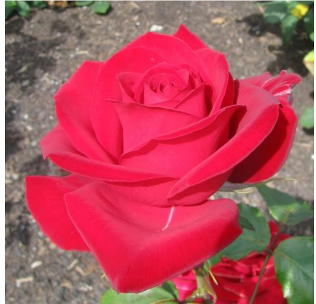
Figure 5. Rosa 'Olympiad' (Macauck).

Sam was also a very astute businessman and often roses were named for a particular person or product. The most successful of Sam's roses in this aspect was 'Olympiad' (Macauck) which was the official rose of the 1984 Olympic Games in Los Angeles. 750000 plants were propagated in that year alone.