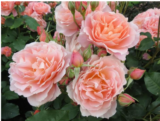
Figure 13. Rosa 'My Mum' (Mattmum).