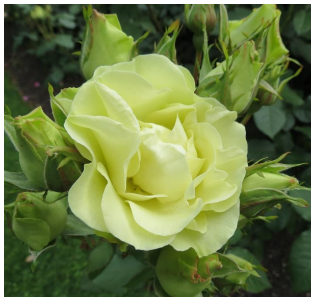
Figure 11. Rosa 'Green with Envy' (Sompounamu).