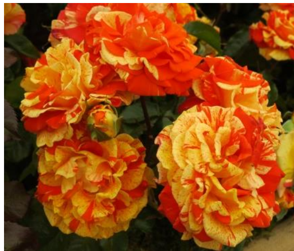
Figure 3. Rosa 'Oranges N Lemons' (Macoranlem).

Sam was a very innovative breeder and among his roses created were the 'creepy crawly' groundcovers such as 'Snow Carpet' (Maccarpe), 'hand-painted' roses such as 'Picasso' (Macpic), 'Old Master' (Macesp) and 'Rock N Roll' (Macfirwal); and striped roses such as 'Oranges N Lemons' (Macoranlem), 'Michelangelo' (Mactemaik) and 'Hurdy Gurdy' (Macpluto).