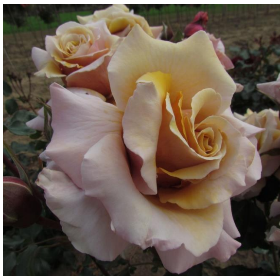
Figure 9. Rosa 'Caramel Swirl' (Forrusty).